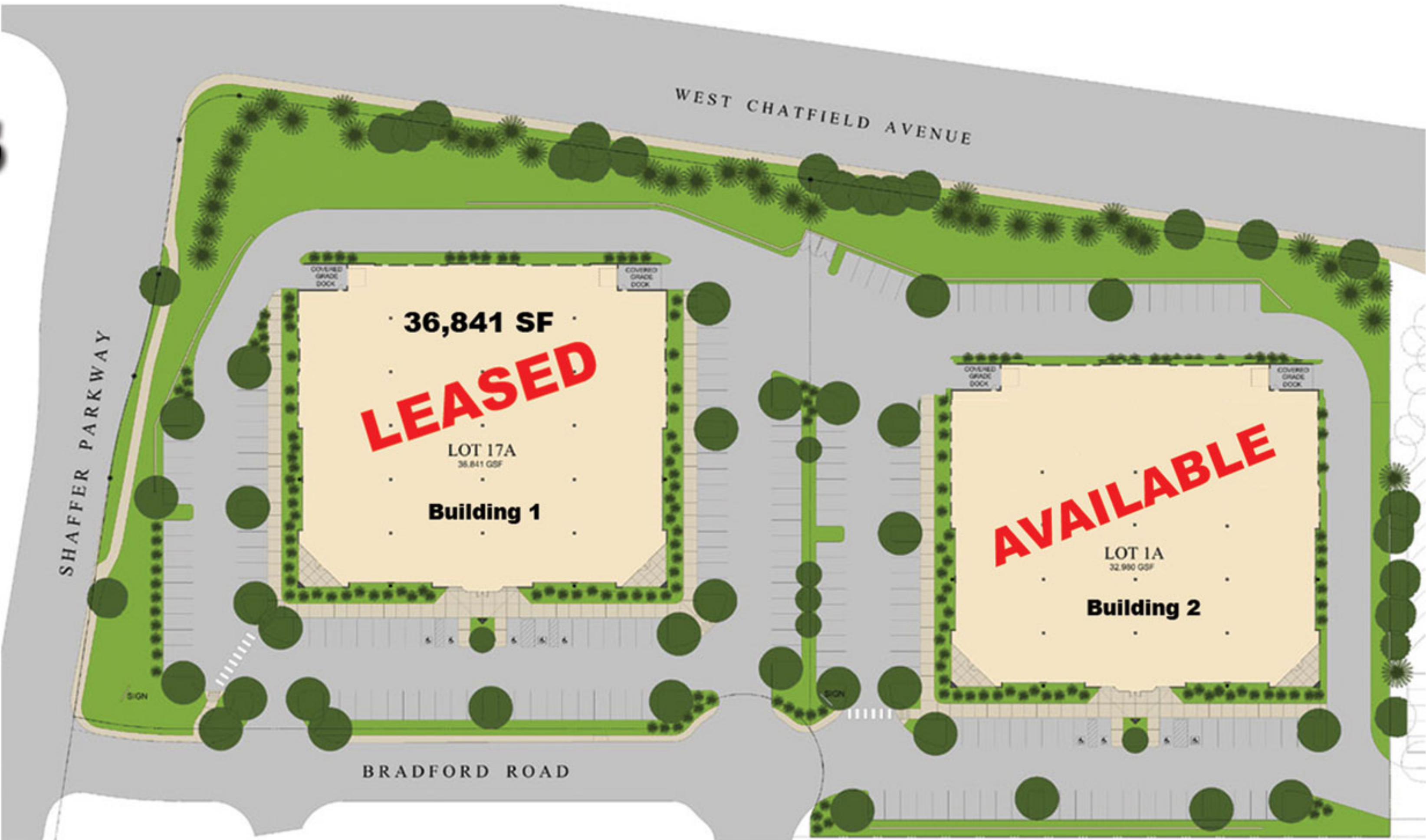
Ken Caryl Commons Jefferson County, Colorado